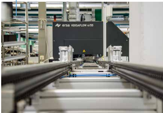
Perfectly aligned: Peripherals from Pacha Automation at Ersa VERSAFLOW 4/55.