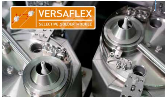
Ersa VERSAFLEX soldering module – individually adjustable solder pots in x/y and z direction.

Features of the new mini power supply units: great performance in the smallest space, effective operation thanks to excellent efficiency over the complete load range and lowest performance loss during idle times, as well as various performance classes with different output voltages. The requirements on the remit for the machine manufacturer were therefore formulated as follows: "Soldering diverse variants without changeovers, in the required cycle time." The challenge lay, on the one hand, in the layout of the boards – there were three different circuit board panels, all differing in terms of size and proximity of the connections, as LOGO!Power