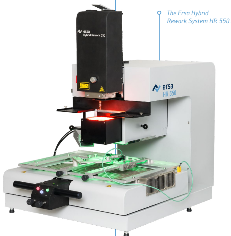
The Ersa Hybrid Rework System HR 550.

The HR 550 is a high-performance rework system for demanding tasks. Jörg Nolte, Product Manager at Ersa GmbH, paraphrases the development requirements for the HR 550 as follows: "Our objective was to create a universal rework system that is very easy to operate. Many customers have a large number of variants when repairing assemblies and components, coupled with a number of different users who always have to achieve a good repair result. For this reason, we have developed a system that guides the user through the different working steps like no other."